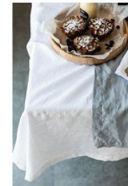
4 x White table cloth (178 x 274 cm)